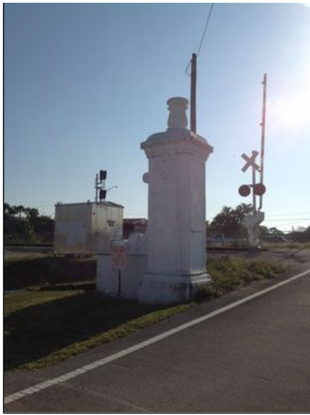
Lake Boynton Estates gate (present)