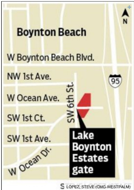
The only remaining entrance gate at Lake Boynton Estates has been designated historic. The Lake Boynton Estates is said to be ... Read More

But there's already someone who is interested in fixing it.