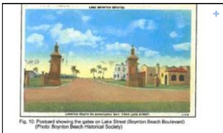
Fig. 10. Postcard showing the gates at Lake Street (Boynton Beach Boulevard)

The area has changed – Interstate 95 and Tri-Rail tracks took over the area – and the once beautiful and extravagant entrance-way no longer remains.