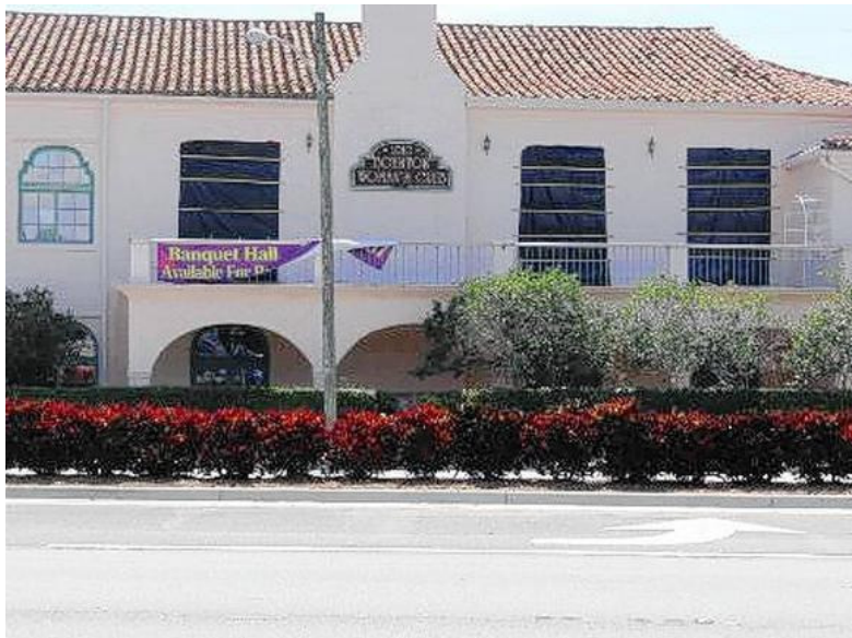
Renovations on the historic Boynton Woman's Club has begun.

Beautiful Brick Patios triplebricks.com/ Professional Brick Patio Installers A+ BBB, 10 year warranty lic. & ins